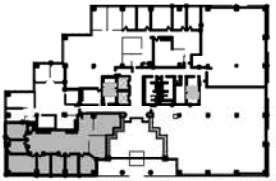
SECOND FLOOR REFERENCE PLAN (no scale)